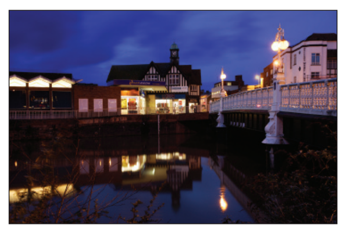
A calm evening in Taunton, which allows the River Tone to reflect perfectly the ornate Tone Bridge and surroundings.

The world famous Pulteney Bridge, Bath, bathed in early morning sunshine.