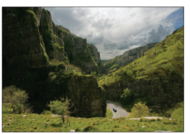
A car travels down Cheddar Gorge towards the town, under a moody sky.