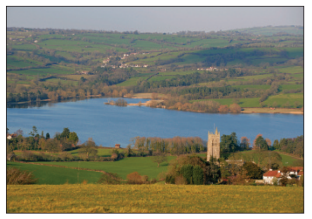
View over a calm Blagdon Lake from the Mendip Hills, with St Andrew's church in the foreground.