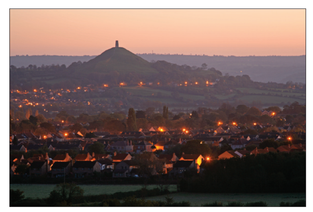
The town of Street starts to awaken to a frosty morning, with Glastonbury Tor making the perfect backdrop.